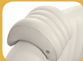
Comfortable headrest – fits on top of the spa wall