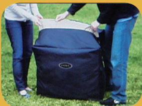
Carry bag included for easy transport & storage