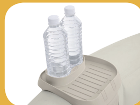
Drinks Holder – Removable for convenience

PureSpa provides relaxation at the touch of a button. The easy-to-use control panel activates the high performance bubble jets surrounding the interior of the spa for a refreshing massage. The heating system adjusts to suit your personal temperature preference allowing a stress free spa experience. PureSpa is simple to maintain with easy-to-replace filter cartridges for lasting enjoyment for up to 4 people.