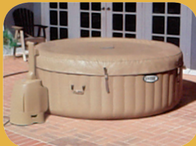
Insulated cover to minimise heat loss