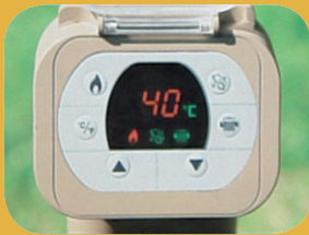
Easy to set up and user-friendly interface