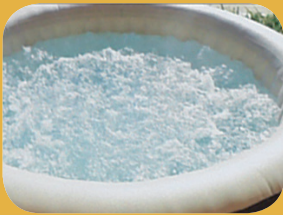
Relax surrounded by soothing bubbles